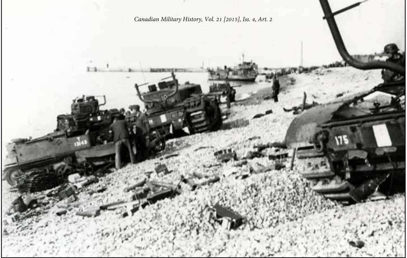
Canadian Forces photo PMR 86-289

In the immediate aftermath of the failed raid German soldiers comb through the debris of the battle searching for intelligence.