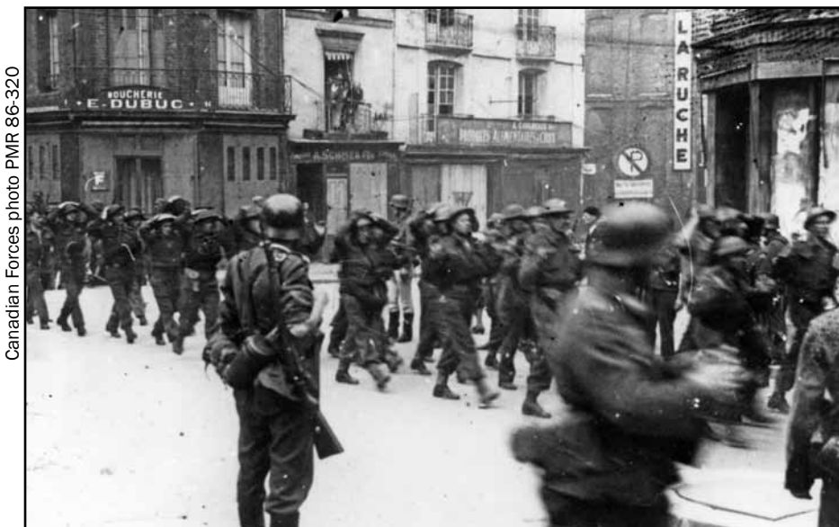
Canadian Forces photo PMR 86-320

Canadian prisoners are escorted away from the beach, Dieppe, 19 August 1942.