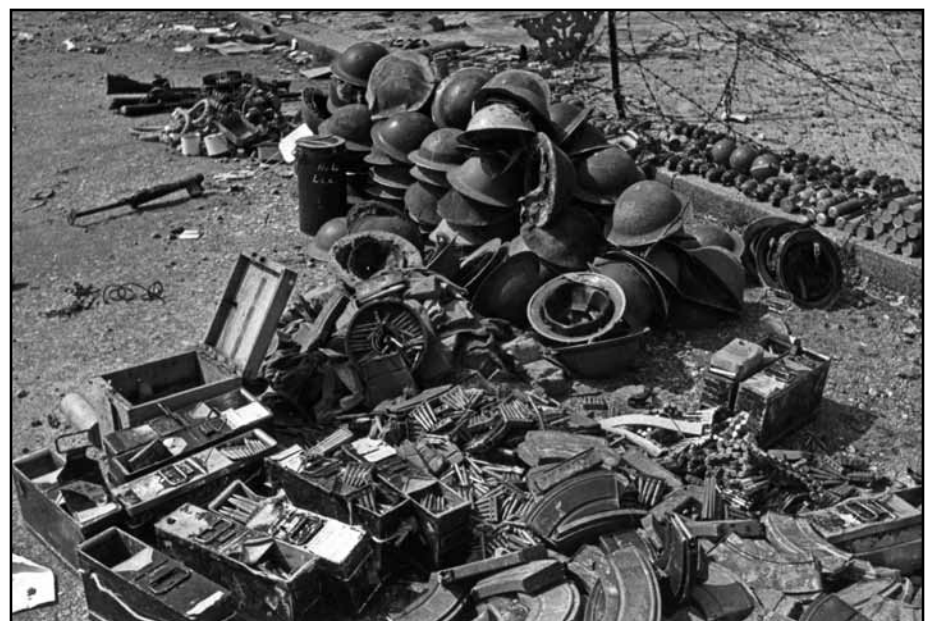
Canadian Forces photo PMR 86-257

The weekly newsreel of 26 August 1942 was 19 minutes long. It began with an eight minute feature on the Dieppe raid, using a map taken from a captured officer to explain the British plan and execution of the raid, the successful defence by the German coastal garrison, and ended with large columns of Canadian prisoners being marched off the beach and through Dieppe into captivity. Throughout the film report the cameras provided a panorama view of the beach front revealing a large number of destroyed tanks and landing craft, and hundreds of