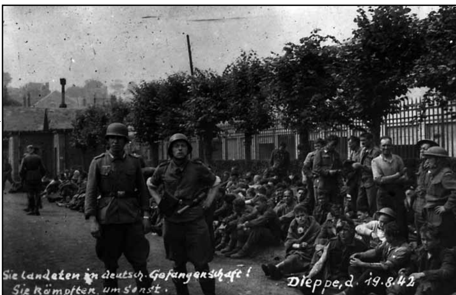
PMR 86-298

The weekend ended with the first screening of a newsreel that showed the results of the Dieppe raid. Images of shattered tanks and landing craft shrouded in the smoke of battle filled the screen. The beaches were littered with the debris of beaten and demoralised soldiers: hundreds of discarded helmets, rifles and other weapons, and a few remaining bodies of the dead that had not yet been removed for burial. Goebbels further noted in his diary that the newsreel footage was “proof of the English plan of attack on Dieppe and the large plans of the British and Americans.” 20 Of equal importance, it was visual proof of the totality of the German victory. The propaganda value of the raid had been enormous but Goebbels was not content to let the story end with nothing more than triumphant boasting of a battle fought and won. He had read British and American newspaper reports of the raid and noticed that, in addition to prematurely and falsely declaring the invasion an overwhelming success, they ignored the significant contribution made by the Canadians. It was time, he thought, to shift the focus away from the military conduct to the political consequences of the raid. 21